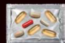
DIETARY SUPPLEMENT 30 PAKS

CODE 208912 DIRECTIONS: As a dietary supplement, for optimal health benefits, take the contents of one packet daily with food every morning. On workout days, for individuals looking to maximize energy production, the Thermo Igniter 12X (red capsule) can be taken 30-60 minutes prior to exercise. Each pak contains: