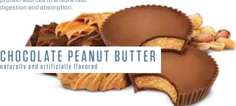
CHOCOLATE PEANUT BUTTER naturally and artificially flavored

ISO100 is made with pre-hydrolyzed protein sources to ensure fast digestion and absorption.