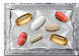
DIETARY SUPPLEMENT 30 PACKS

NUTRITION SUPPORT* with an ultra-concentrated multivitamin