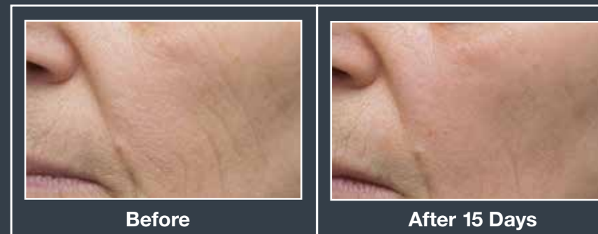
unretouched photo, after twice daily use