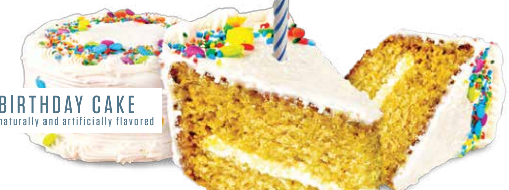
BIRTHDAY CAKE naturally and artificially flavored

ISO-100 is made with pre-hydrolyzed protein sources to ensure fast digestion and absorption.