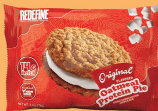
ORIGINAL OATMEAL PROTEIN PIE