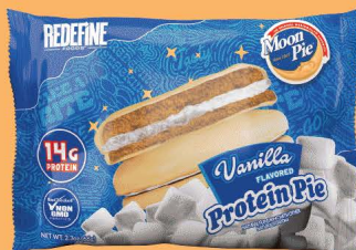
MOON PIE (VANILLA)

REDEFINESNACKS.COM INSTAGRAM: @REDEFINEFOODSOFFICIAL TIKTOK: @REDEFINEFOODS